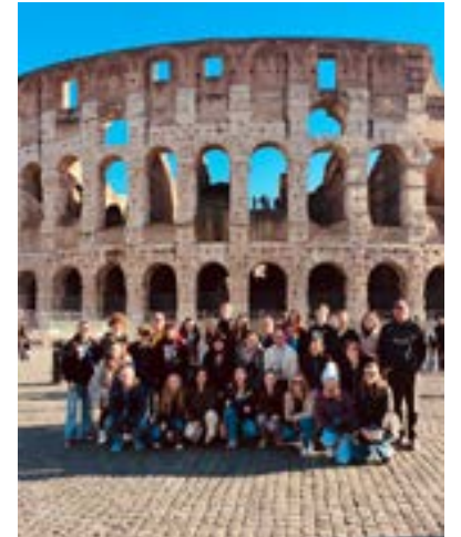
J-Term students traveled to Greece and Italy