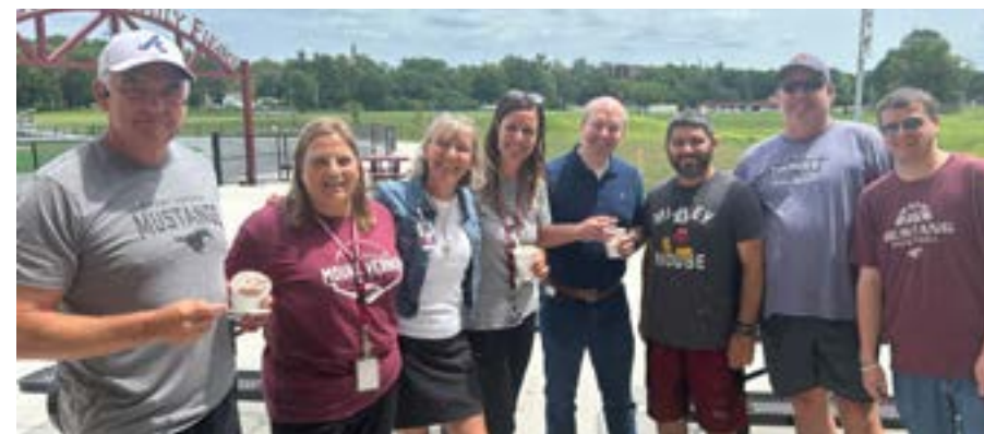
MV Staff enjoying ice cream on a warm summer day