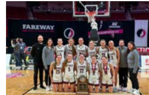
Mustang Girl's Basketball State Runner-Up Finish