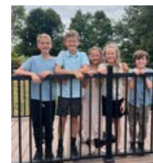
National Math Stars semi-finalists