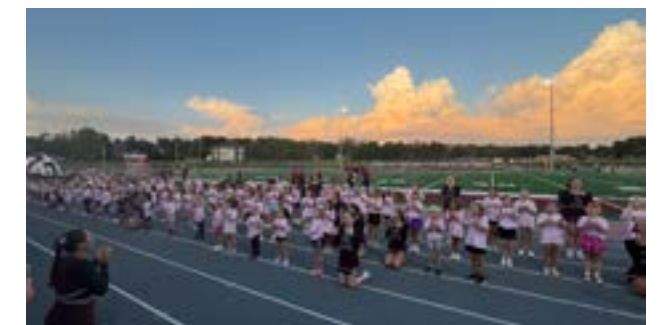
Mini Mustang Cheerleaders were 116 strong