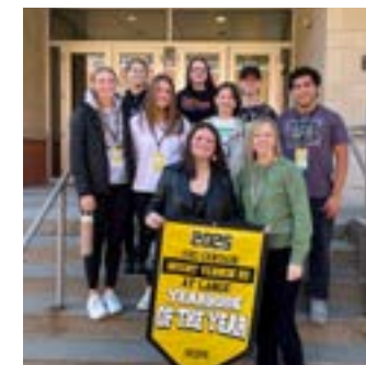
Journalism students were awarded a banner for Yearbook of the Year