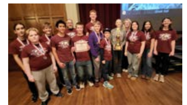
Middle School Science Olympiad brought home first place at the State Tournament