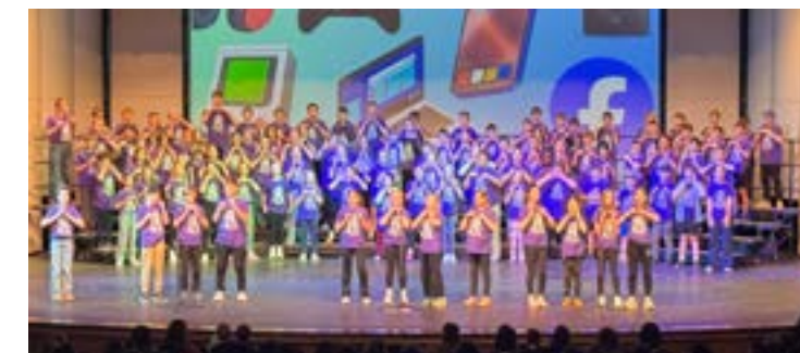
5th Grade Musical Performance: A Kid's Life