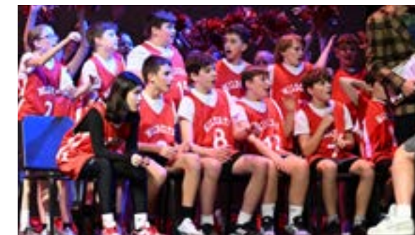
Middle School Musical Performance: High School Musical Jr.