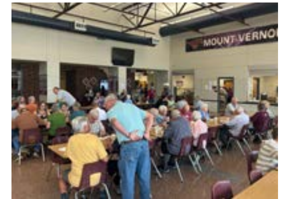
A great crowd enjoying breakfast and conversation